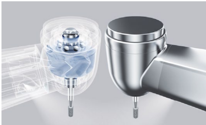
High tech in high detail – that’s power.

The best thing for you about SIROBoost is: The powerful turbine. Time wasted stopping and starting work on a tooth is finally a thing of the past. With a powerful 22 watts, you now have even more torque and even more sensation. SIROBoost not only makes your usual routines easier, but also keeps the volume low. And the LED integrated in the coupling provides a perfect view of your field of treatment at all times. So you can concentrate fully on your patient.